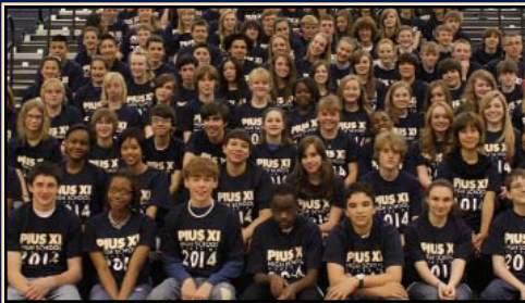
The Class of 2014 invites you to discover why they chose Pius XI High School!